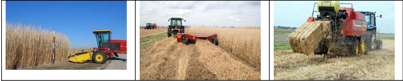
Cutting, chopping, and baling Miscanthus x giganteus in late winter.